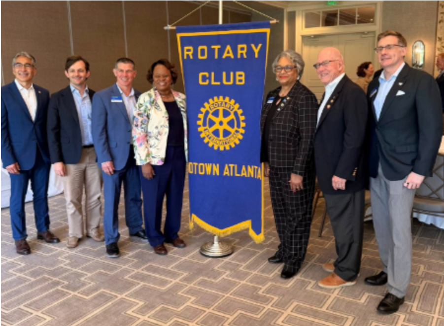
Midtown Atlanta RC celebrates 70 years of service