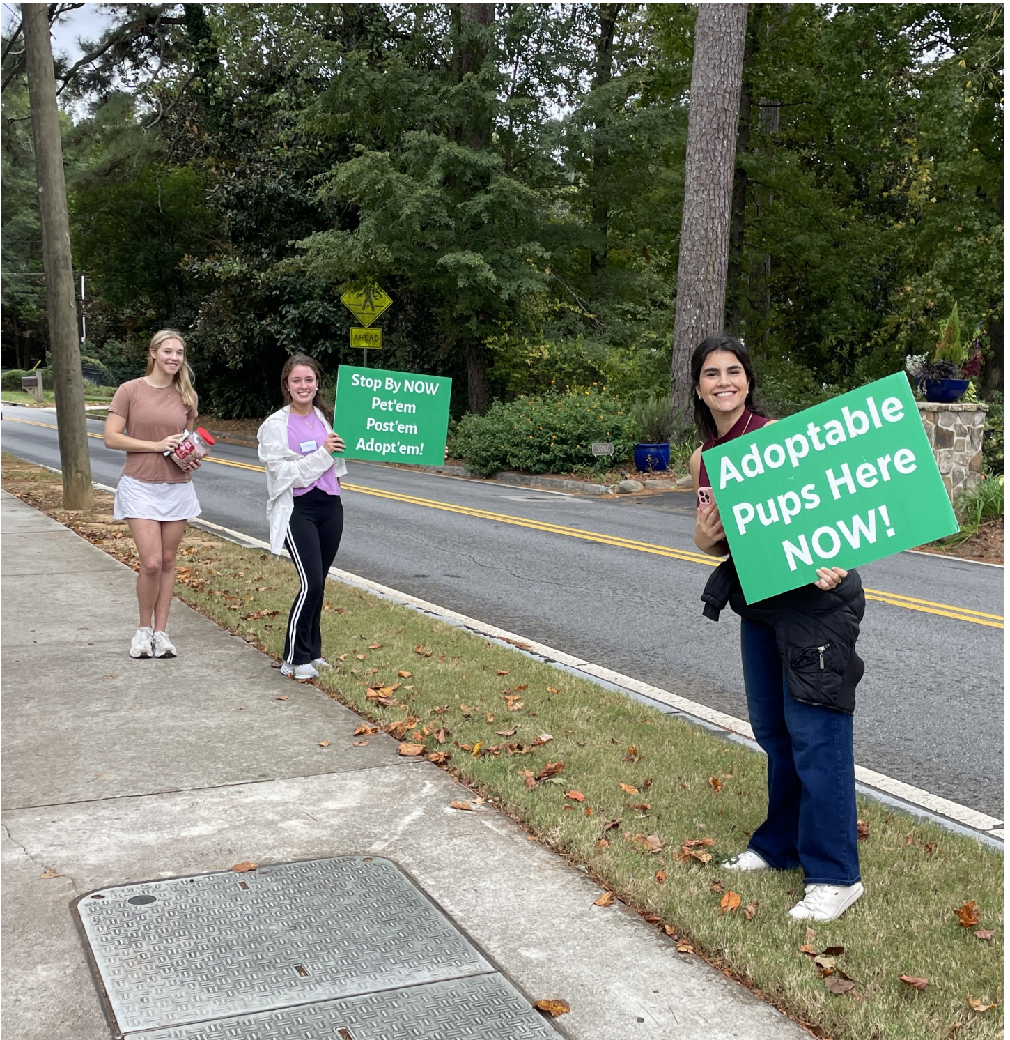
Posted by Shelley Hammell November 5, 2025