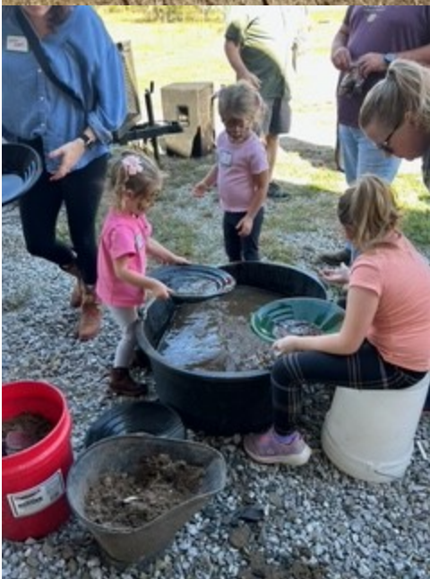
Posted by Lynne Lindsay November 5, 2025