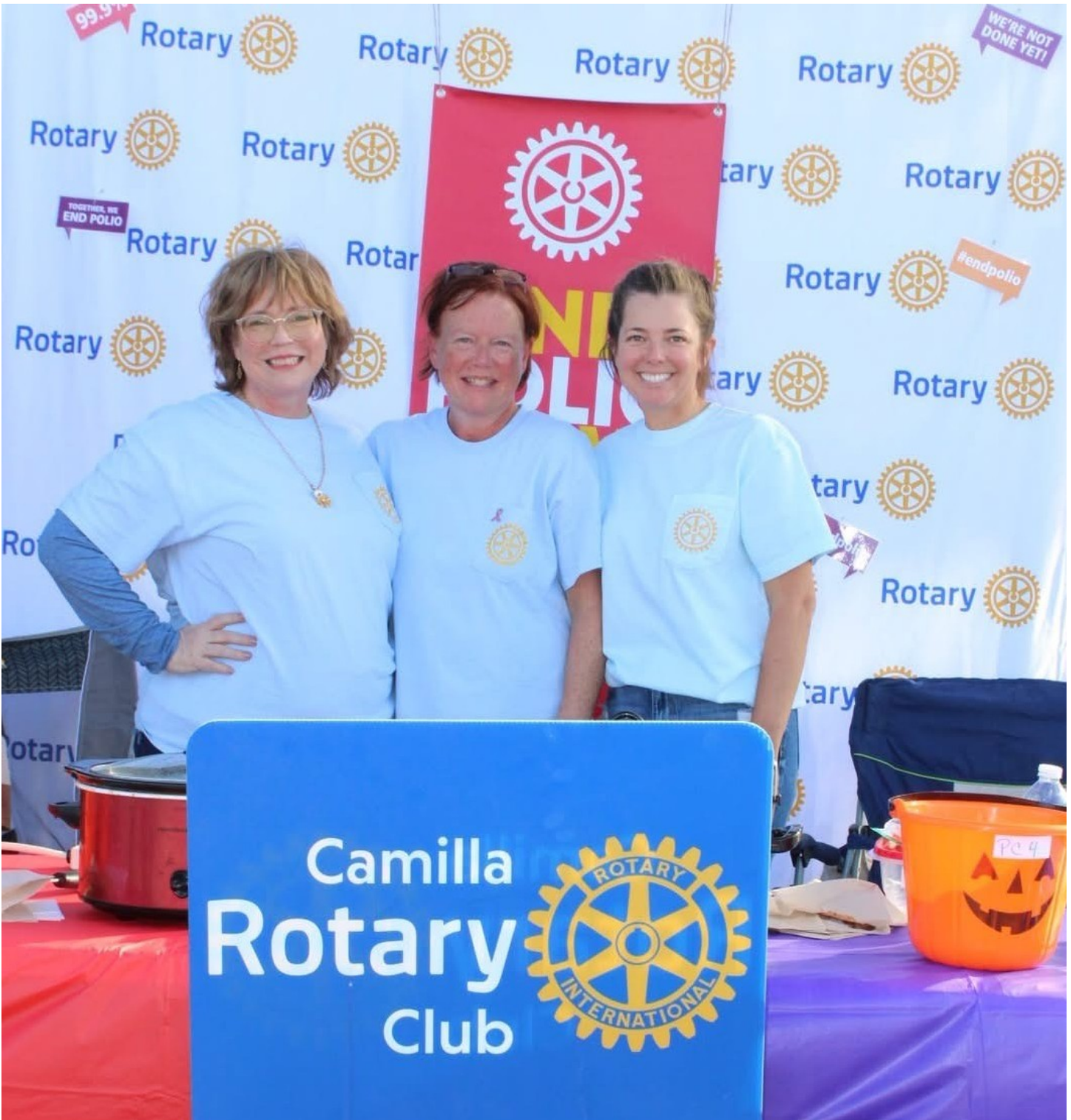
Posted by Wynita Cannon November 4, 2025