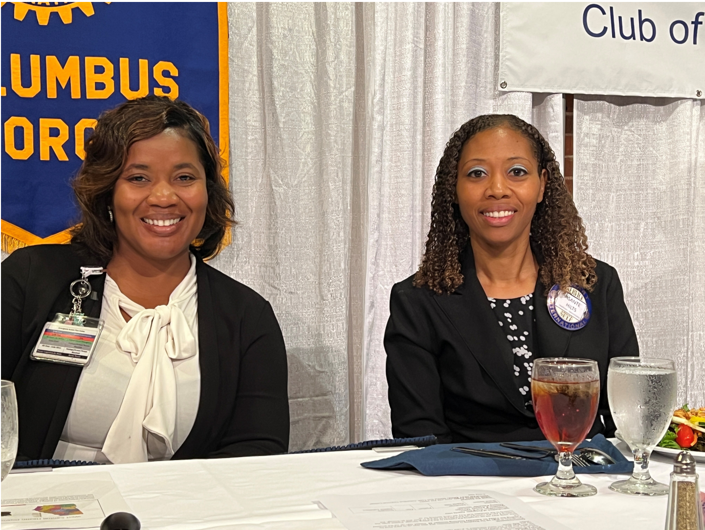
Posted by LeighAnn DiCesaris November 5, 2025