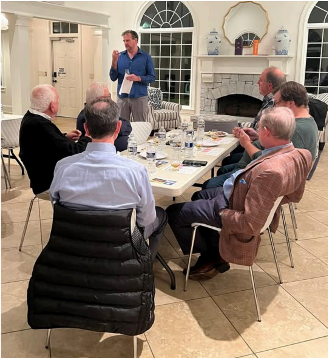
Posted by Bob O'Brien November 4, 2025