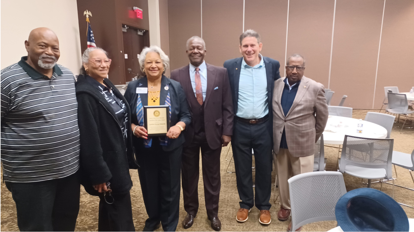
Posted by Darlene Daly April 2, 2025