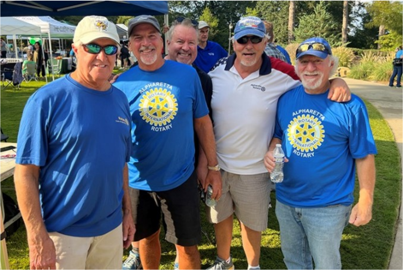
Posted by Clark Savage October 30, 2023