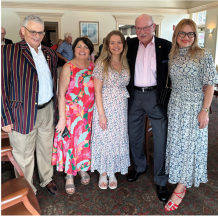
Posted by Julie Bond October 1, 2023