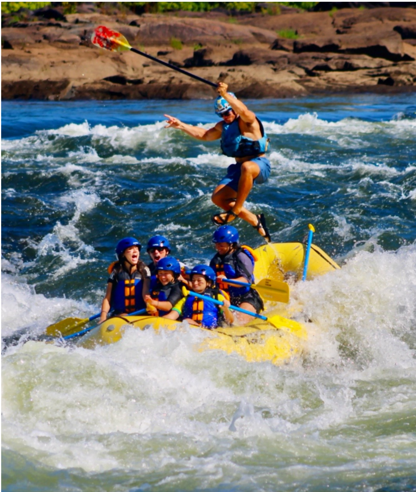
Posted by Katheryne Fields August 28, 2024