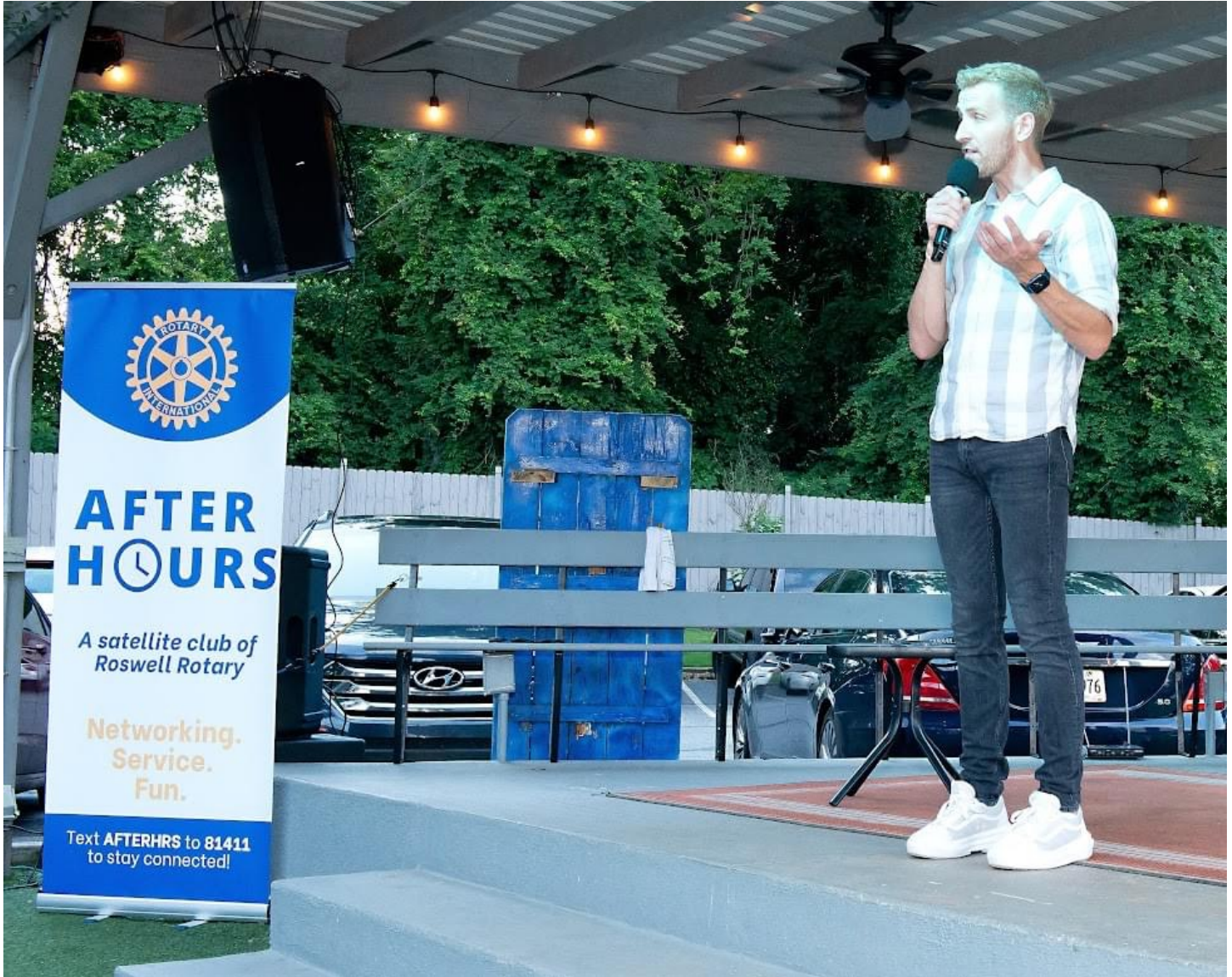
Posted by Becky Nelson July 5, 2023