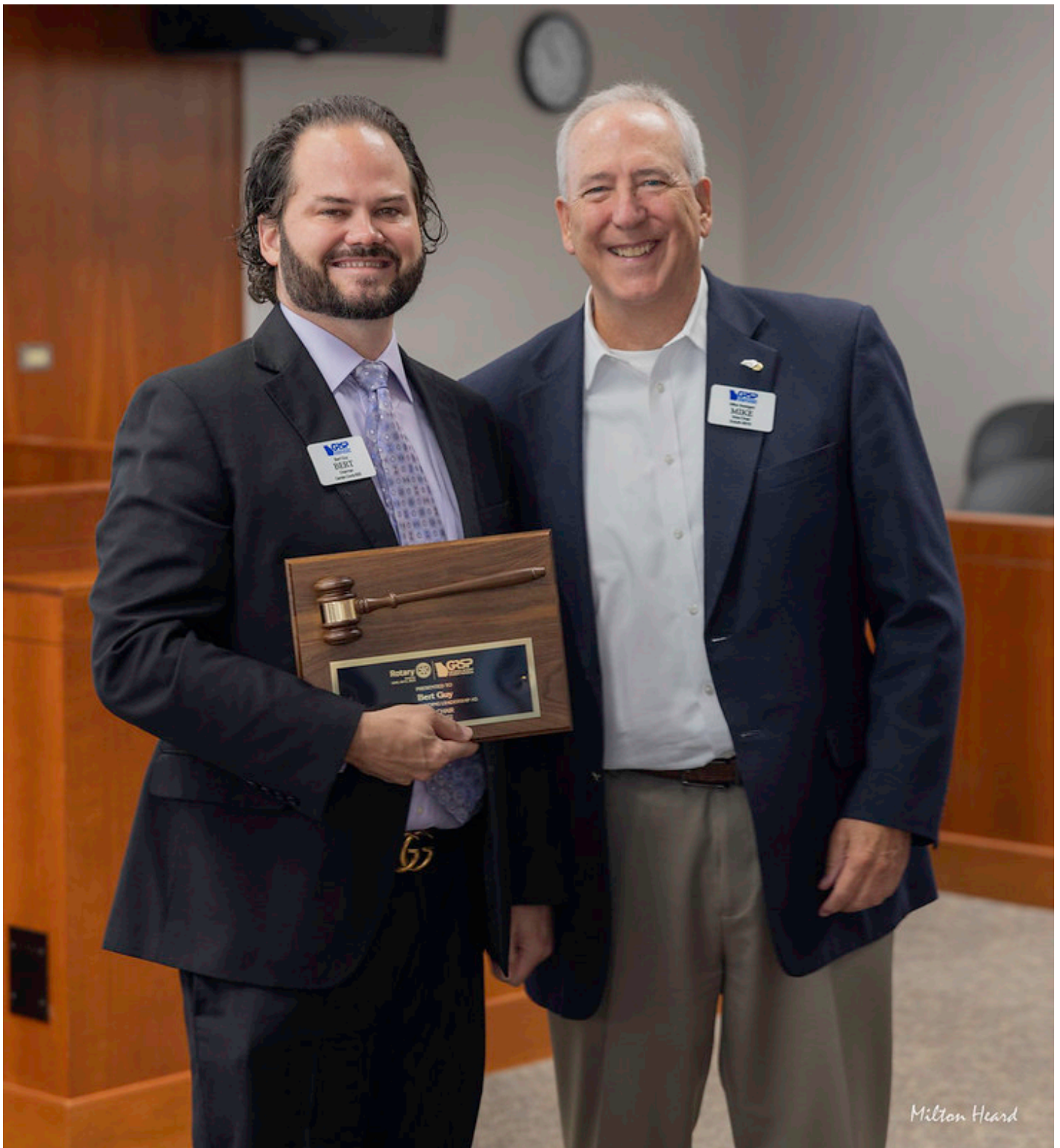
Posted by Katheryne Fields July 26, 2022