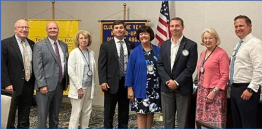
Marietta Metro's new leadership team