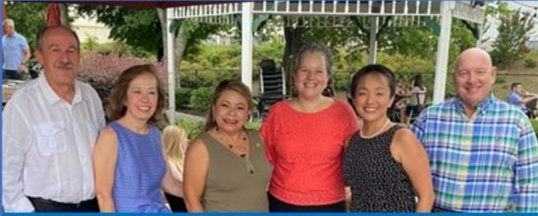
Atlanta Brasil – celebrating three-year anniversary